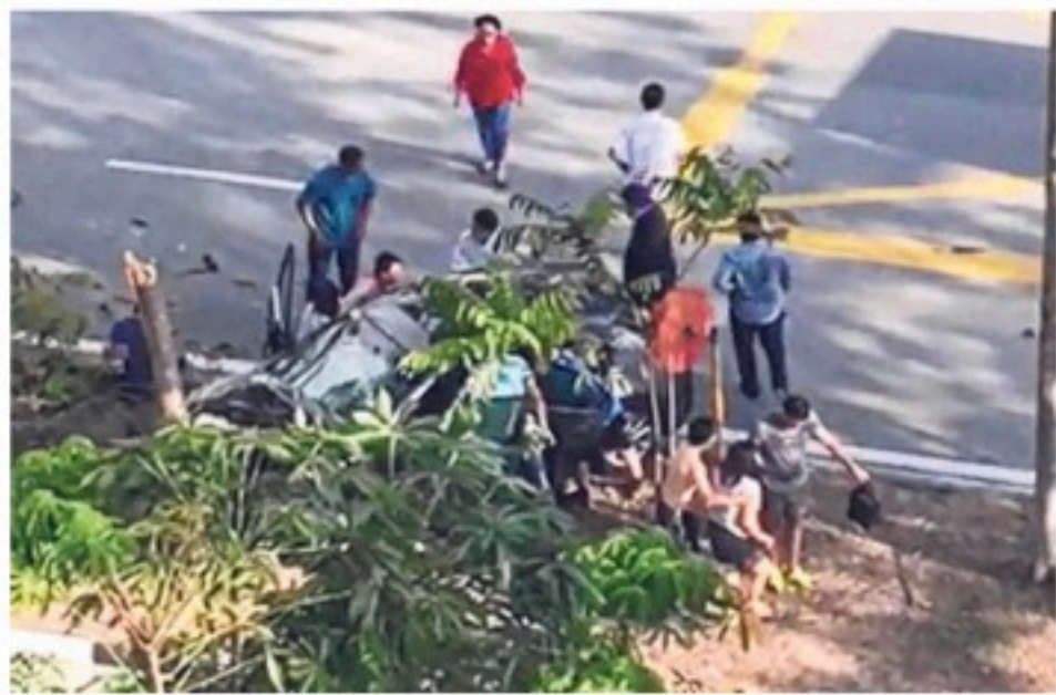
(Above) Passers-by attending to those injured in the crash, in which a car hit three (below).

When he reached the crash scene, parishioners and passers-by were attending to the man's wife, who was unconscious.